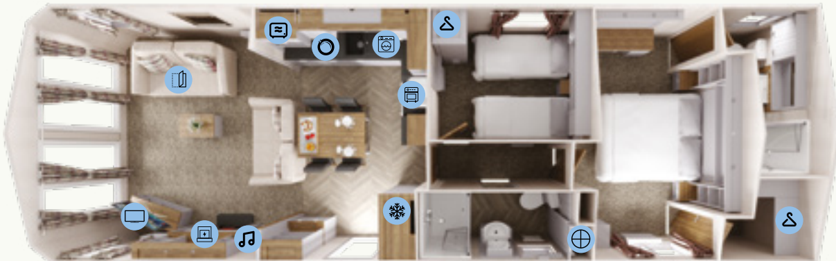
Sheraton • 40 x 13 • 2 bedroom