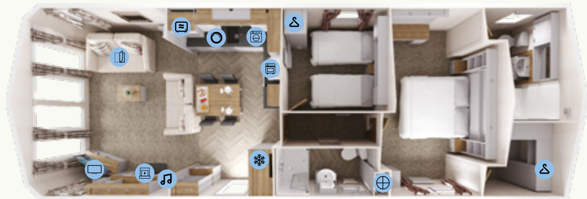
Sheraton Elite • 42 x 14 • 2 bedroom