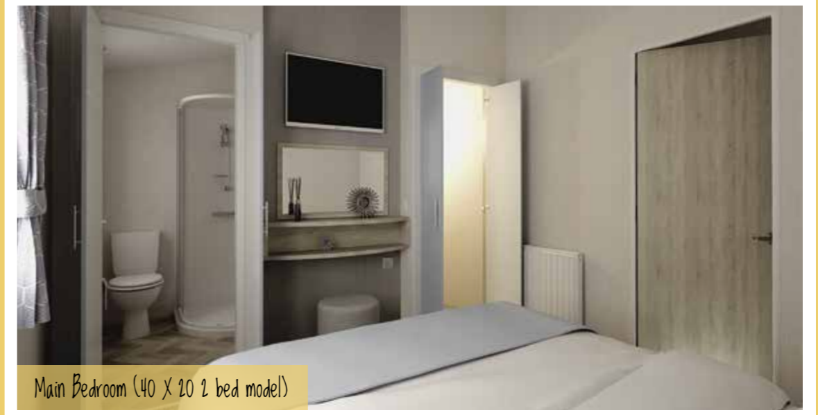
Main Bedroom (40 x 20 2 bed model)