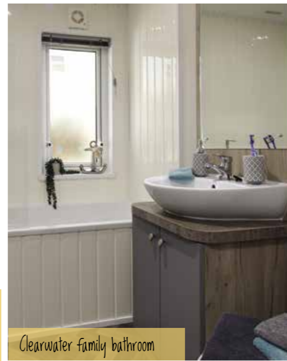
Clearwater family bathroom