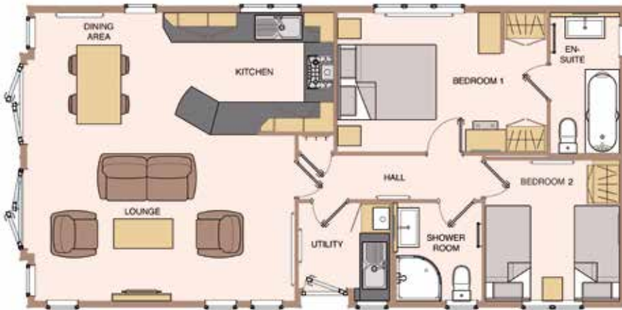
40' x 20' (12.192m x 6.012m) 2 bedrooms, utility, shower room and en-suite bathroom

The Kingfisher is available in a range of standard floor plans, examples of which are shown below. We can modify the floor plans to suit your individual requirements. Please contact our sales team for more details.